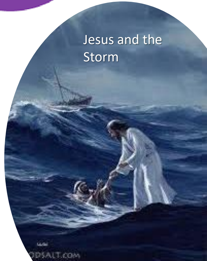
Jesus and the Storm